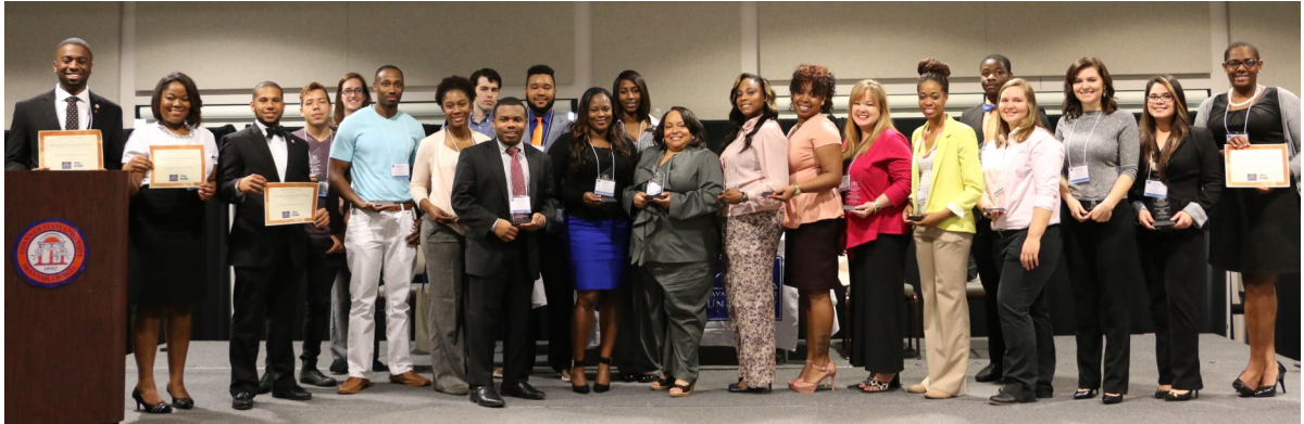
SSU Graduate and Undergraduate student award winners at the 5th Annual Research Conference